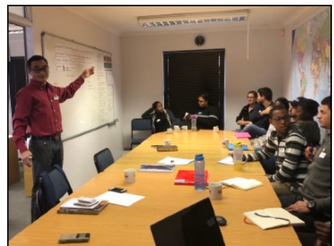
ABOVE: Business as Missions Training